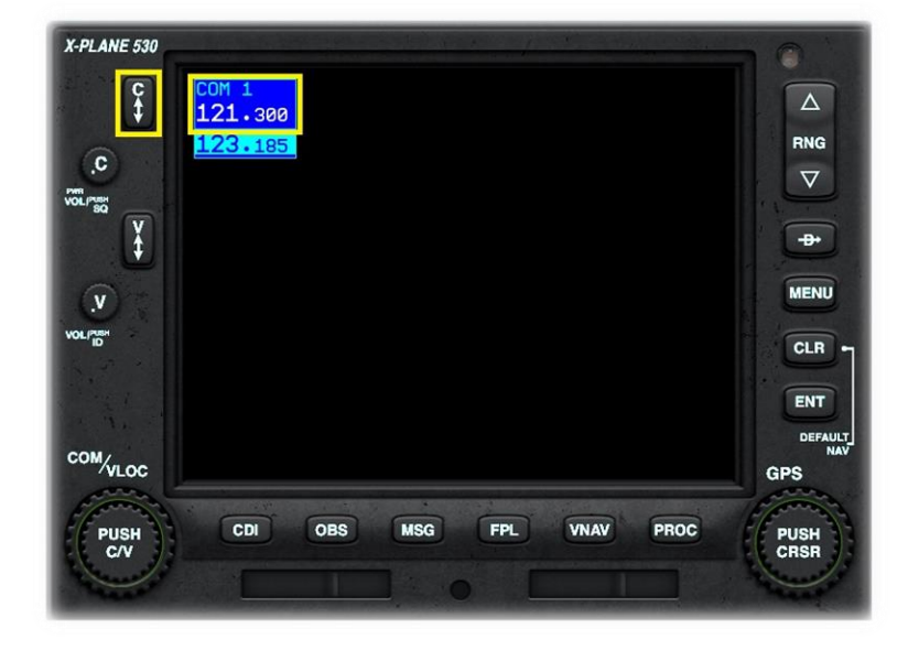
Click the Comm Frequency Flip-Flop Key to swap the standby and active COM frequency.

Note: Click and hold the Comm Frequency Flip-Flop Key for the emergency frequency.