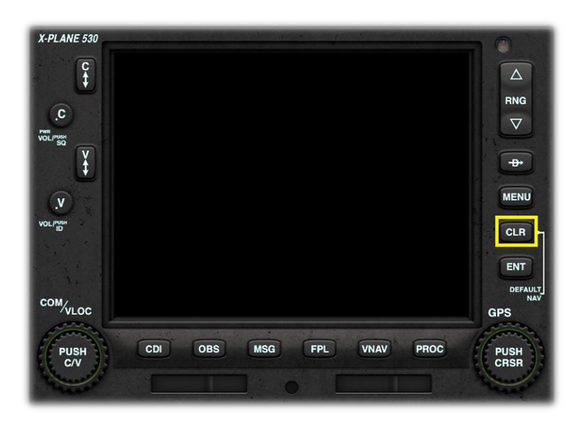
To quickly go to the Navigation Page Group: