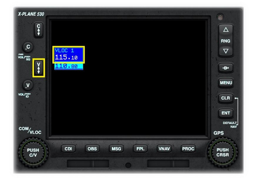
Click the VLOC (VOR / Localizer) Frequency Flip-Flop Key to swap the standby and active NAV frequency.

Click the Comm Inner Rotary at the 3 O'clock position to decrement the NAV frequency - decimal portion.